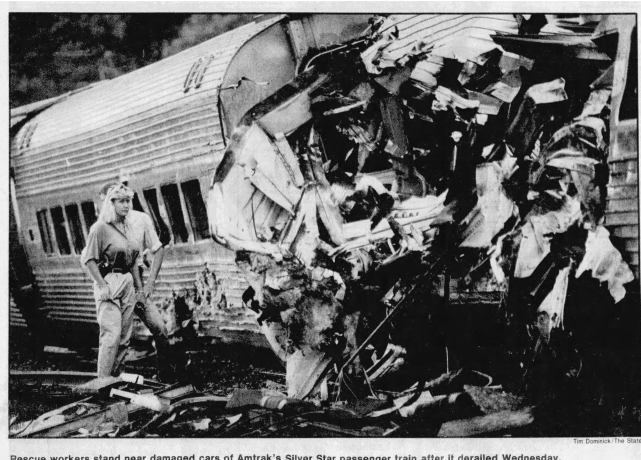
Rescue workers stand near damaged cars of Amtrak's Silver Star passenger train after it derailed Wednesday.

someone stole his tools at the plant. Peoples pleaded guilty and was sentenced to 10 years in prison.